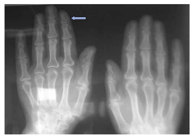
FIGURE 2. Plain X-ray of the hands \rightarrow showing deposit of calcium crystals (arrow) in the skin around the distal phalanges of the fingers.

Zafeiris Sardelis 3<sup>rd</sup> Department of Pneumonology Medicine "Sotiria" Hospital for Chest Diseases 152 Mesogeion Avenue, 11527 Athens, Greece e-mail: zafsard@yahoo.com